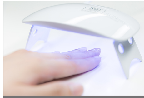
STEP 7. Cure with UV LED lamp for 10-120 seconds, depends on the nail dryer.