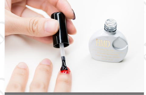
STEP 8. Apply HMD no wipe Premium Top Coat for all nails, cure under UV LED lamp for 5-60 seconds, depends on the nail dryer.