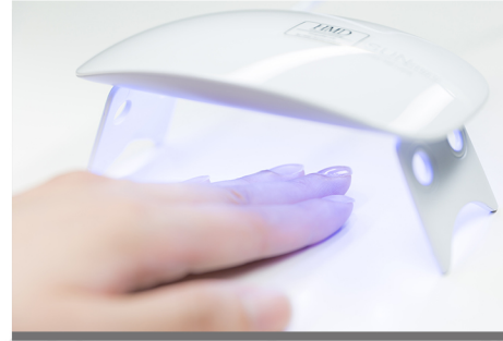
STEP 3. Cure with UV LED lamp for 10-120 seconds, depends on the nail dryer.