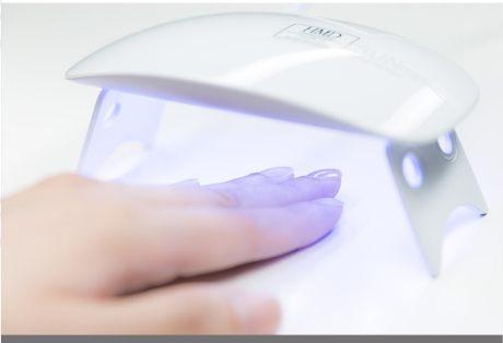
STEP 5. Cure with UV LED lamp for 10-120 seconds, depends on the nail dryer.