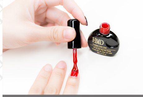
STEP 6. Apply 2nd thin layer of HMD color gel coat.