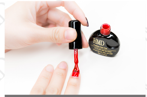
STEP 4. Apply 1st thin layer of HMD color gel coat directly.