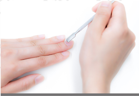
STEP 1. With normal manicure process, clean nails and then trim nail surface.

*STEP 4 & 5 are optional. These two steps are additional steps to create darker color Cat Eye Effect. For normal Cat Eye Effect, please skip these two steps.