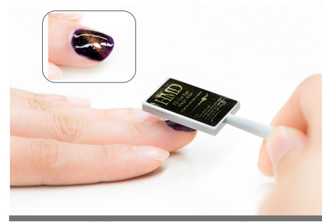
STEP 7. Hold the HMD Magic Stick about 2mm above the nail surface for 5 seconds until 3D pattern shows up.