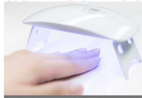
STEP 3. Cure with UV LED lamp for 10-120 seconds, depends on the nail dryer.