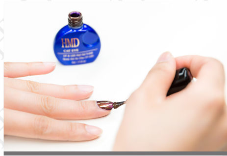
STEP 6. Apply HMD 3D Cat Eye Gel Nail Polish, DO NOT cure under UV LED lamp.