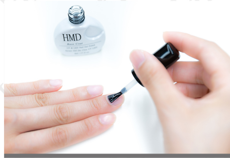
STEP 2. For long lasting result, apply HMD Base Coat first.