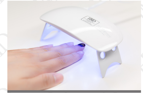
STEP 8. Cure with UV LED lamp for 10-120 seconds, depends on the nail dryer.